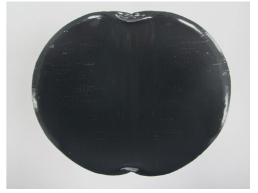
Mixing pattern to be expected when processing using a mixing and dosing system

-> Check for homogeneous mixing of the two components! Fine white streaks in the mixture are tolerable when processed from side-by-side cartridges.