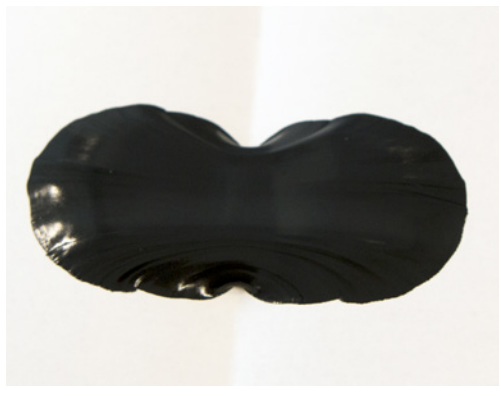
Pull paper apart - Expected mixing pattern during cartridge processing