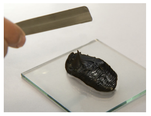
"Chewing gum" consistency, the sealant "Pulls back" ->Pot life has been reached

This test serves to ensure the perfect homogeneity of the mixture.