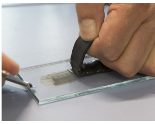
-> Pull off the adhesive bead and assess the fracture pattern. If there is a cohesion break in the adhesive, the adhesion to the substrate is perfect.