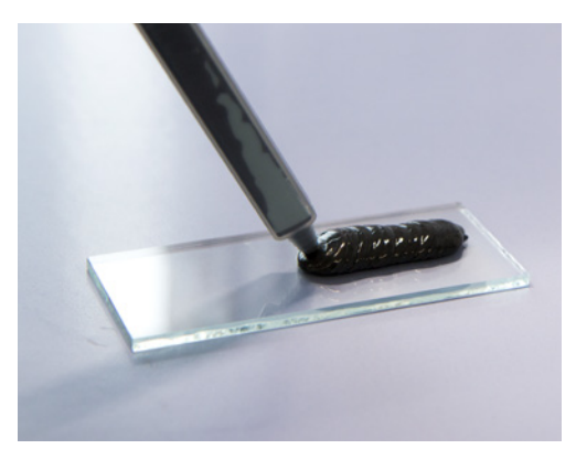
Applying the adhesive

The peel test checks the perfect adhesion of the adhesive to the substrates to be bonded. A strip of adhesive approx. 10 \times 10 mm wide or thicker should be applied to the substrates pre-treated in accordance with the specifications in the technical data sheet of the 2-component adhesive. A length of 10 cm is sufficient for the adhesive strip. After a curing time of 24 hours, cut the adhesive on one side with a knife and attempt to pull the adhesive off the substrate by hand at an angle of > 90^{\circ} .