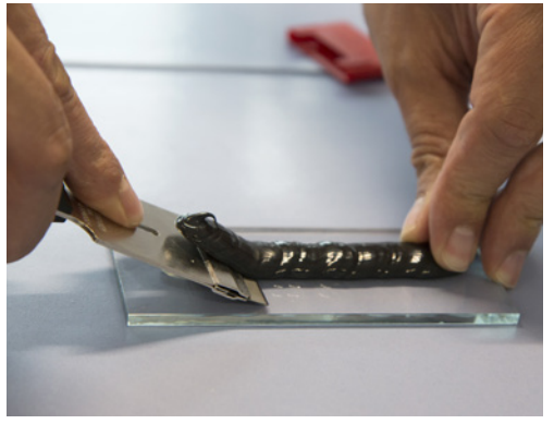
Cutting between adhesive and glass pane