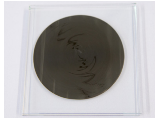
Glass plate test – Expected mixing pattern during cartridge processing

During the glass plate test, a small quantity of mixed adhesive is applied to a clean glass (dimensions approx. 10 \times 10 \text{ cm} ). A second piece of glass is then placed on top and the two glasses are pressed together. The adhesive between the glasses must have a uniform, homogeneous colour. When processing from side-by-side cartridges, fine white stripes are tolerable.