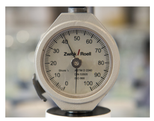
-> Measuring the Shore A hardness with a durometer