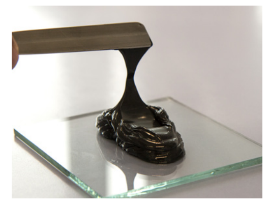
Paste-like consistency, spreadable -> Pot life has not yet been reached