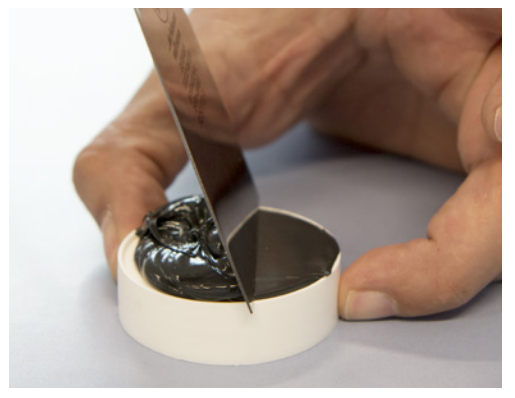
Pull sealant off smoothly