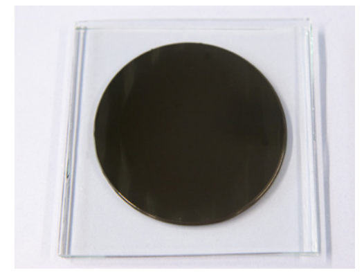
Glass plate test – Mixing pattern to be expected when processing using a mixing and dosing system