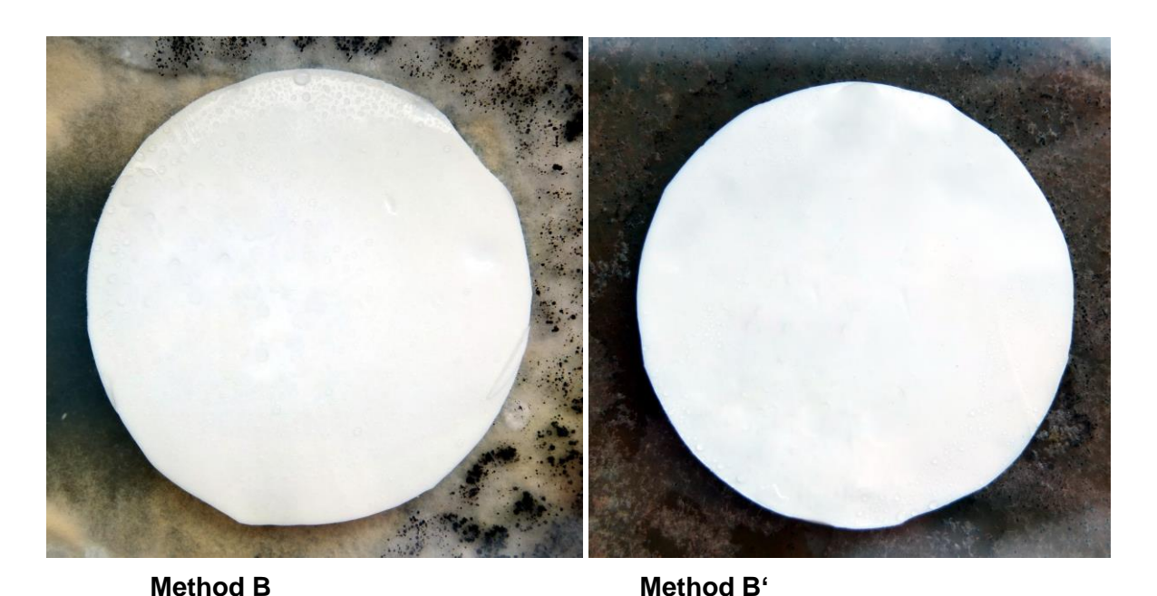
Photo 1: Material OTTOSEAL® S 68, color white after an incubation period of 28 days (method B and B') without visible fungal growth