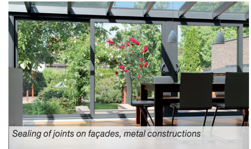
Sealing of joints on façades, metal constructions