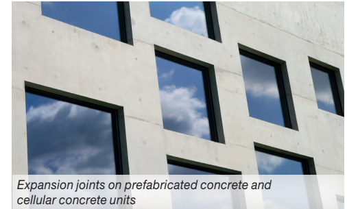
Expansion joints on prefabricated concrete and cellular concrete units