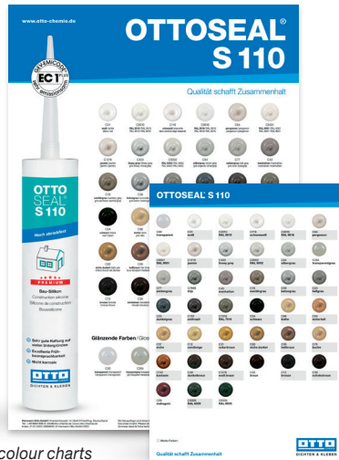
OTTO colour charts

Because it is available in many different colours, OTTOSEAL® S 110 can always be used to achieve the perfect visually coordinated result. The correct colour selection is made easier by our high quality colour charts with original colour patterns.