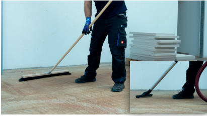
1 Preparation of the substrate