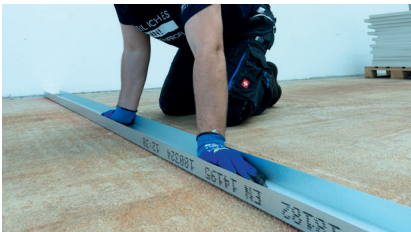
5 Align and press on the profile