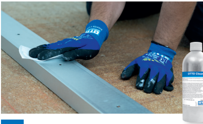
3 Cleaning the underside of the profile